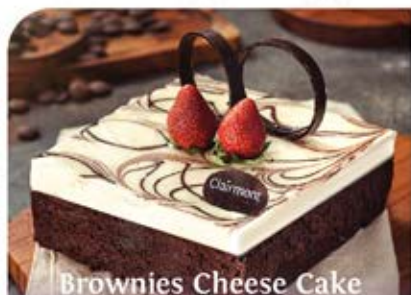
Brownies Cheese Cake

SLICE Rp 33,000 30X30 Rp 789,000 15 Ø Rp 229,000 30X40 Rp 979,000 20 Ø Rp 359,000 40X60 Rp 1,875,000 20X30 Rp 549,000