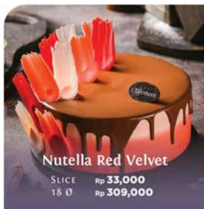
Nutella Red Velvet