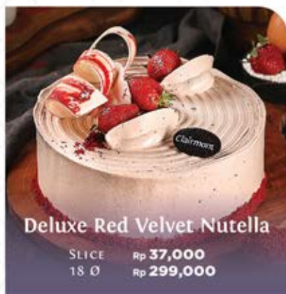
Deluxe Red Velvet Nutella