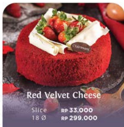
Red Velvet Cheese