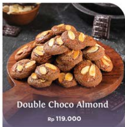
Double Choco Almond