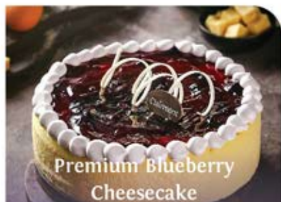
Premium Blueberry Cheesecake

SLICE Rp 33,000 30X30 Rp 789,000 15 Ø Rp 229,000 30X40 Rp 979,000 20 Ø Rp 359,000 40X60 Rp 1,875,000 20X30 Rp 549,000