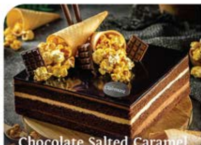
Chocolate Salted Caramel

SLICE Rp 37,000 30X30 Rp 953,000 15X15 Rp 279,000 30X40 Rp 1,353,000 20X20 Rp 429,000 40X60 Rp 2,203,000 20X30 Rp 653,000